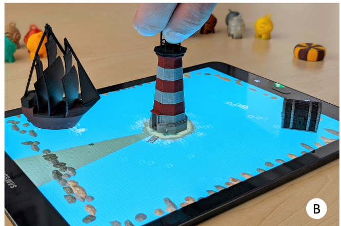
Figure 1: (A) Multi-material component during the 3D printing process and (B) an electrical functional 3D printed multi-material component in use in an interactive board game.