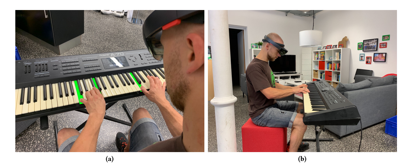
Figure 1: Student using an HMD to practice piano. HMDs have the potential to provide visual and auditory assistance during practice sessions.

existing approaches are affected by several drawbacks [15]. First, they are mainly focused on the positioning of finger targets. They lack posture information and focus mainly on where the students have to place their fingers. Second, they are unresponsive and cannot adjust to the student's current needs in real-time. This includes the adjustment of waiting times in which the student has to put their hands into place. Third, they might interfere with playing the instrument or distract the students. For instance, by incorporating markers or sensors on the instrument that get in the way, the learning experience can be disrupted.