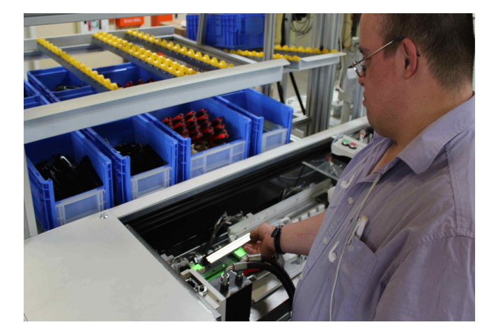
Figure 3: Worker assembling a clamp in a sheltered work organization using in-situ projection assistance. Continuous in-situ assembly instructions were perceived as helpful.

cognitively impaired workers are able to perform few work steps without any support, in-situ instruction provides cognitive alleviation which makes cognitively impaired workers capable of assembling complex constructions that consist of up to 48 parts [10]. Studies on using gamification in working environments showed positive results [12]. Motivation and efficiency of workers with cognitive deficiencies were held high constantly through the assembly. Visual in-situ projections also showed best feedback performance compared to auditory and tactile feedback [13]. Additionally, minor privacy concerns were raised regarding the usage of in-situ projections at workplaces. Auditory feedback was perceived as annoying, while tactile feedback showed to be disturbing to an extent, which impacts the overall worker's performance.