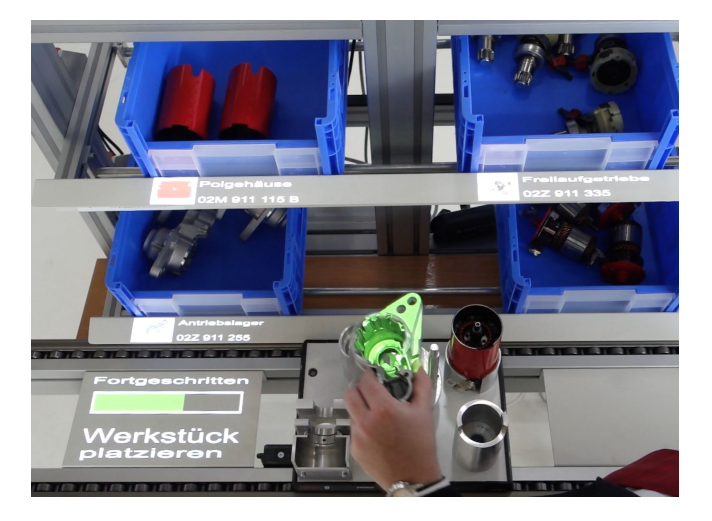
Figure 1: Assembly of an engine starter using in-situ projections. Assembly instructions are displayed into the field of view of the worker. Image source: [8].

In contrast, persons with cognitive impairments who are employed in sheltered working organizations traditionally require permanent supervision by a human instructor. Under-