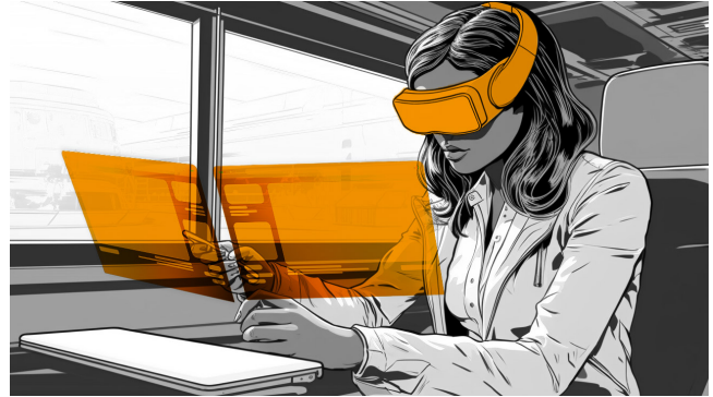
Figure 1: Hybrid interfaces pave the way towards universal interaction, enabling users to accomplish various tasks in varying environments intuitively. For instance, while commuting on a train and browsing the web. Today, hybrid interfaces allow exploring interaction concepts in these challenging conditions.

While hybrid interfaces utilizing smartphones or smartwatches can provide superb usability, better user experiences, and lower workloads [15], these new modalities also introduce new challenges, such as the need to integrate multiple devices and to develop and learn new interaction techniques. While interaction modalities are