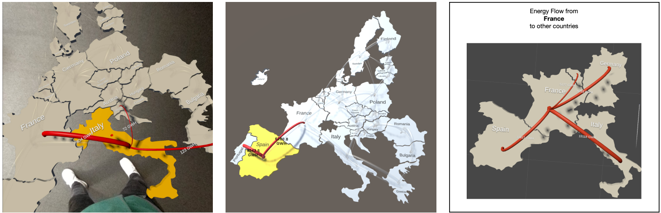
(a) A capture of the Immersive Analysis app. Italy is currently selected as the participant is standing closest to this country, making its data highlighted.